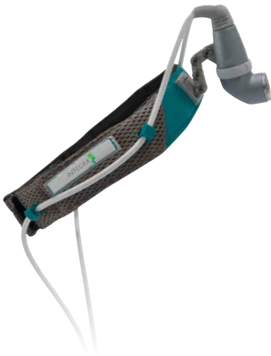
UltraLite Plus Sweatband